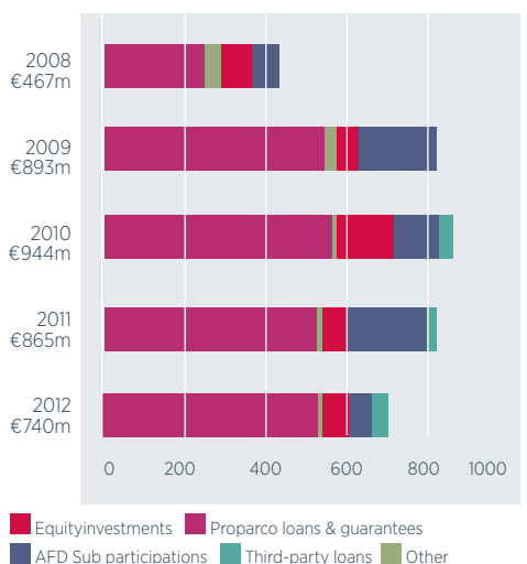
Use of different instruments

capacities of emerging and developing countries. Proparco uses a wide range of instruments as long-term loans in local or foreign currency (senior, convertible), own funds, stockholders' equity, current account, convertible bonds, mezzanine, guarantees and technical support in order to finance the productive sector (with a focus on the agro-industrial sector, manufacturing industries, building materials), infrastructure (developing and improving the effectiveness of infrastructure in transport, energy, communication, water sanitation) and financial markets (to improve the capacities of local markets, local banks and financial institutions). In emerging countries, Proparco is especially focused on sustainable energy (biomass, biogas, hydropower, geothermal energy, wind power system, solar energy). To develop its activity, Proparco follows the sectoral policies framework of the AFD group.